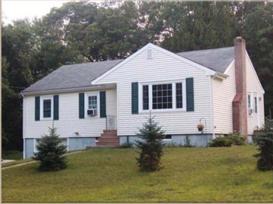
Sold for $155k in 2015